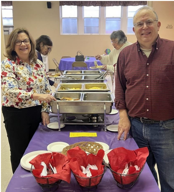
The loles host the feast