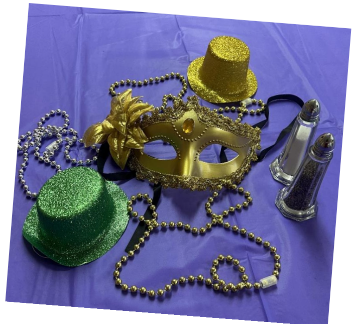
Mardi Gras Decor